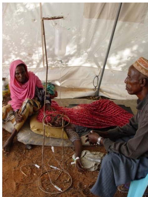
CTC center in Baidoa.

Health, water and sanitation partners continue to focus on AWD outbreak prevention and control, in particular through the provision of medical supplies, emergency health kits, chlorination and water treatment at source and point of use (household level). To enhance water treatment activities, intensified hygiene promotion activities were implemented. Berdere Water Committee continues to chlorinate water for 673 households. Local NGO Community Care Center carried on with community mobilization and sensitization on AWD in Baidoa town and 15 villages in Bay district. Radio messages through Warsan radio station in Baidoa on cholera prevention are ongoing. The Somalia Association for Rehabilitation and Development (SARD) is chlorinating 205 wells in Baidoa and Burhakaba areas. Mumin Global completed the extension of the water supply to the Baidoa CTC in Bay Regional Hospital. The NGO also continues to provide water supply services to 350 households in Baidoa town, while UNICEF provides chlorine for chlorination.