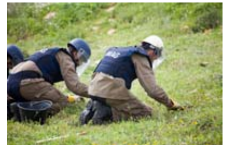
A clearance team working in South Lebanon

• South Lebanon - Removing the threat of cluster bombs and promoting socio-economic development: Under the UNTFHS, the United Nations Mine Action Service (UNMAS) and UNDP have teamed up in a two-year project that combines clearance activities with social and economic rehabilitation, thus seeking to restore both freedom from fear and freedom from want in rural communities of South Lebanon. Multiple efforts are underway to clear the land from dangerous explosive remnants of war and help local populations recover their livelihoods and regain a sense of normalcy. The estimated budget for the project is US$ 2.9 million.