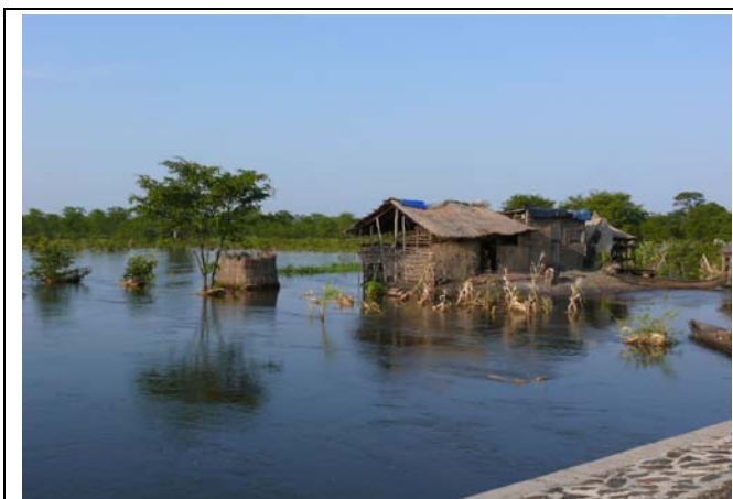
Mukumbi village, Kazungula district