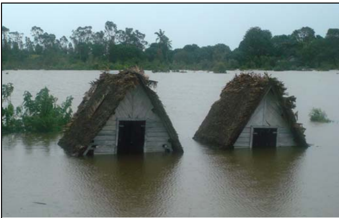
Houses flooded in a village 10km away from Toamasina