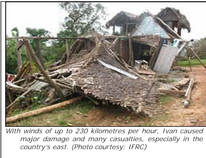
With winds of up to 230 kilometres per hour, Ivan caused major damage and many casualties, especially in the country's east.