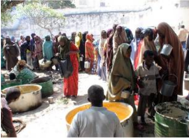
(One of "wet feeding centres" in Mogadishu: Photo: SAACID, 2008)

Due to the unabated levels of insecurity which are still creating significant levels of civilian displacement, the HRF has been supporting essential life-saving activities in Mogadishu and along the Afgooye corridor. The HRF has thus far allocated over US $2.8 million to support partners provide critical assistance to IDPs, ensuring access to clean, safe water and sanitation facilities to prevent the deterioration of health conditions in IDP settlements.