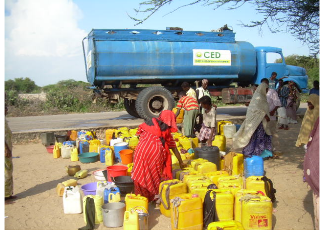
(Water trucking in Afgooye, Lower Shabelle)

In 2008, Norwegian Refugee Council, Oxfam GB/Hijra and a local NGO, FERRO, have built emergency latrines and conducted hygiene promotion. The partnership of Oxfam GB, Oxfam NOVIB, SAACID and a local NGO Centre for Education (CED) has been providing IDPs with access to safe clean water by water trucking, rehabilitating boreholes and setting up water kiosks.