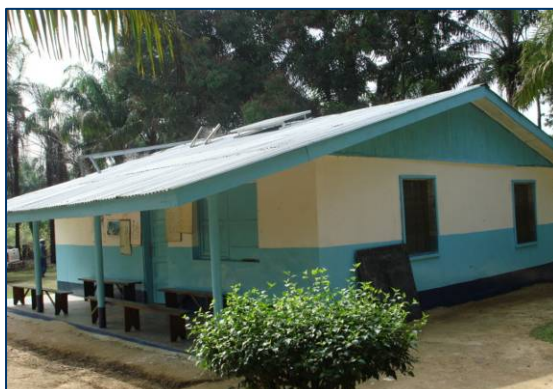
Newly repaired Bodowhea Clinic, River Cess County; © Africa Humanitarian Action (AHA)

In collaboration with the County Health Team, AHA started supporting primary health care services at the four clinics in November 2007. At the Kangbo and Zammie Town Clinics, where the renovation work is on-going, health services are still being provided in the dilapidated facilities. These two clinics will also receive essential drugs, non medical supplies, equipment and furniture. AHA support will run up to June 2008, after which the Ministry of Health and Social Welfare is expected to take over the running of the four clinics.