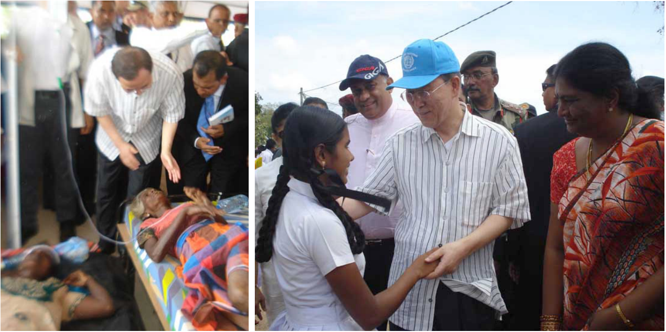
UN Secretary General Mr. Ban Ki-moon visited IDP sites in Vavuniya on 23 May 2009

All humanitarian partners including donors and recipient agencies are encouraged to inform FTS of cash and in-kind contributions by sending an email to: fts@reliefweb.int