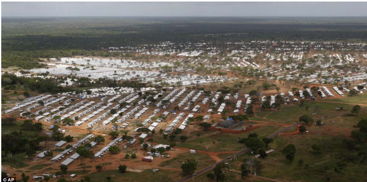
Aerial view of Menik Farm zones 1 and 2 where over 120,000 IDPs are accommodated. In total the Menik Farm sites accommodate over 225,000 IDPs

All humanitarian partners including donors and recipient agencies are encouraged to inform FTS of cash and in-kind contributions by sending an email to: fts@reliefweb.int