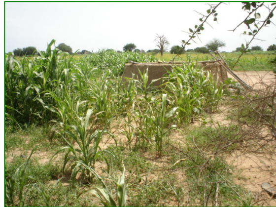
Crops under moisture stress in Southern Sudan

addition to 40,000 existing IDPs from conflicts in the state.