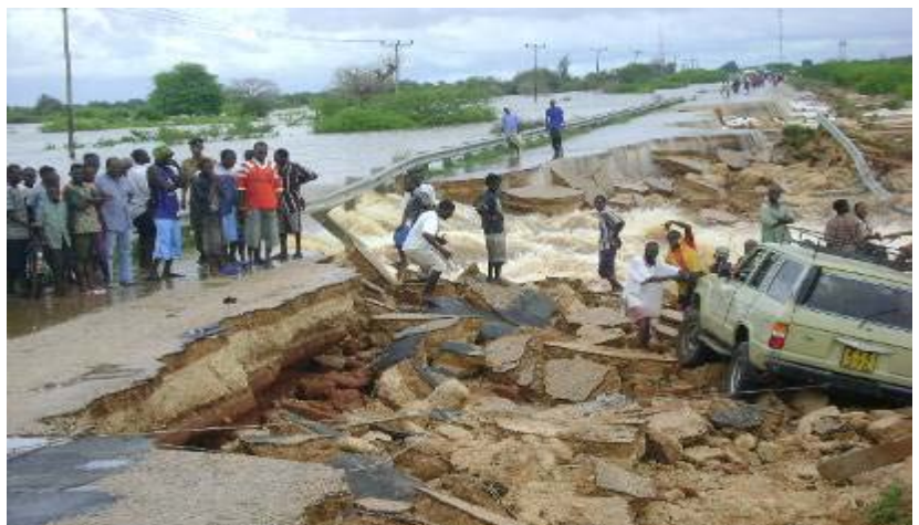
The road to Tana Delta (Garsen), Hola and Lamu is cut off after heavy rains.

Whilst most of Kenya continues reeling from drought consequences, parts of Kenya have been pounded by torrential rains that have left an estimated 2800 people displaced to schools and host family homes in three districts. In Malindi, 430 households have been affected with 60 families displaced, mainly to family and friends' homes after two days of heavy rainfall. A main road to Tana Delta (Garsen), Hola and Lamu has been cut off disrupting access for humanitarian aid to Garrisa refugee camps. Some 40 trucks carrying WFP food aid are stranded in Mangarini district. Five (5) villages - Muyu wa Kae, Kanagoni, Mkono wa jongoo and Kuwanzai, Muthoroni- cannot be accessed. Some 430 households have been affected with 60 families